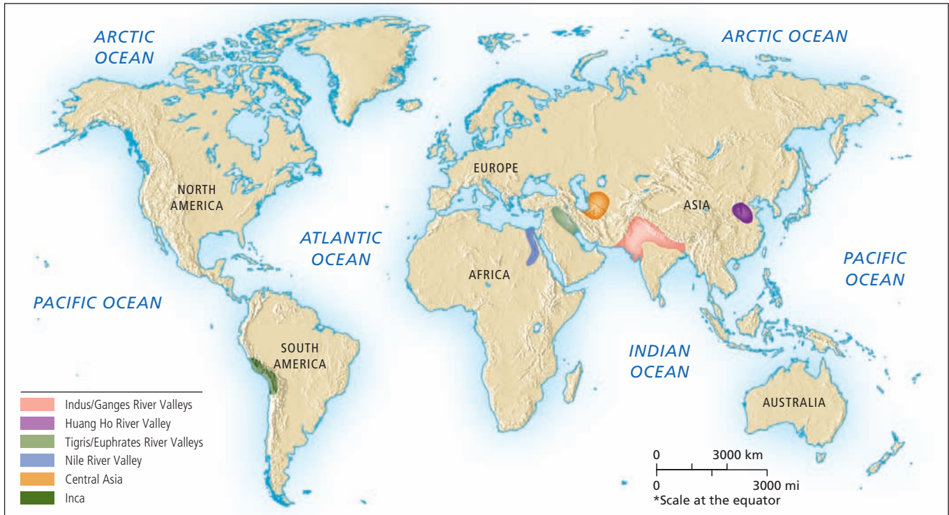
Map 1.1 The Beginnings of Civilization

Civilizations developed independently in India, China, central Asia, and Peru, as well as in Egypt and southwest Asia. Western civilization, however, is rooted in the civilizations that first emerged in Egypt and southwest Asia. What five features make up the “complete checklist of civilization”?