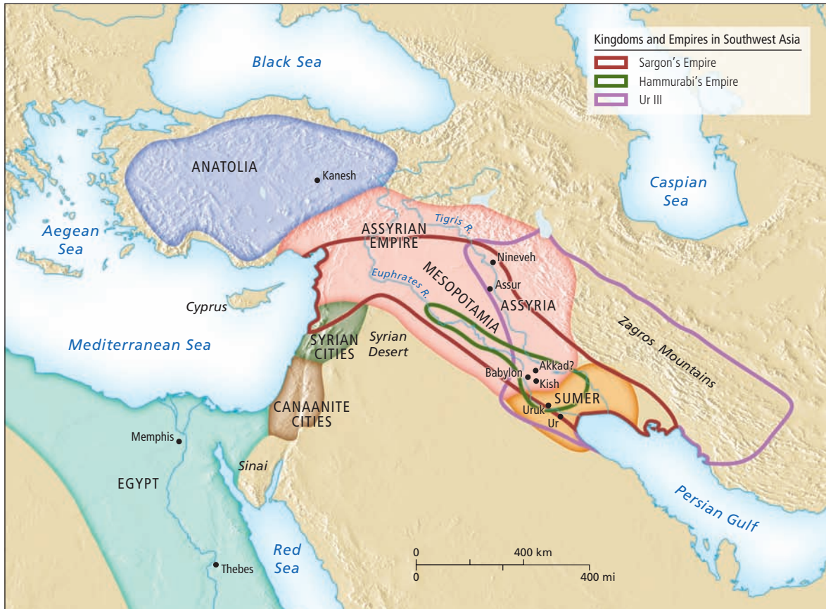
Map 1.4 Kingdoms and Empires in Southwest Asia

Between 3000 and 1500 B.C.E., the Sumerian city-states, Sargon's Akkadian Empire, Hammurabi's empire in Babylon, and the Ur III dynasty emerged in southwest Asia. What features did these four different political entities share?