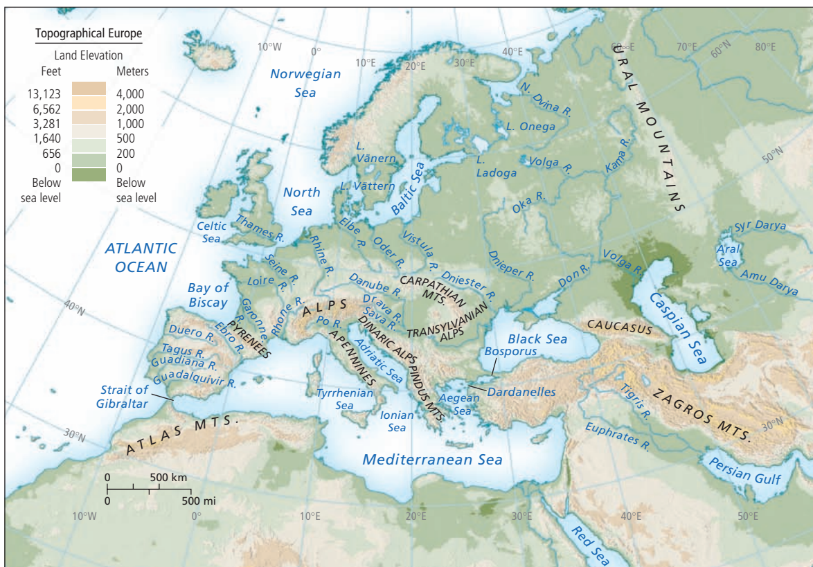
Map 1 Core Lands of the West

These are the principal geographical features that will appear recurrently throughout this book.