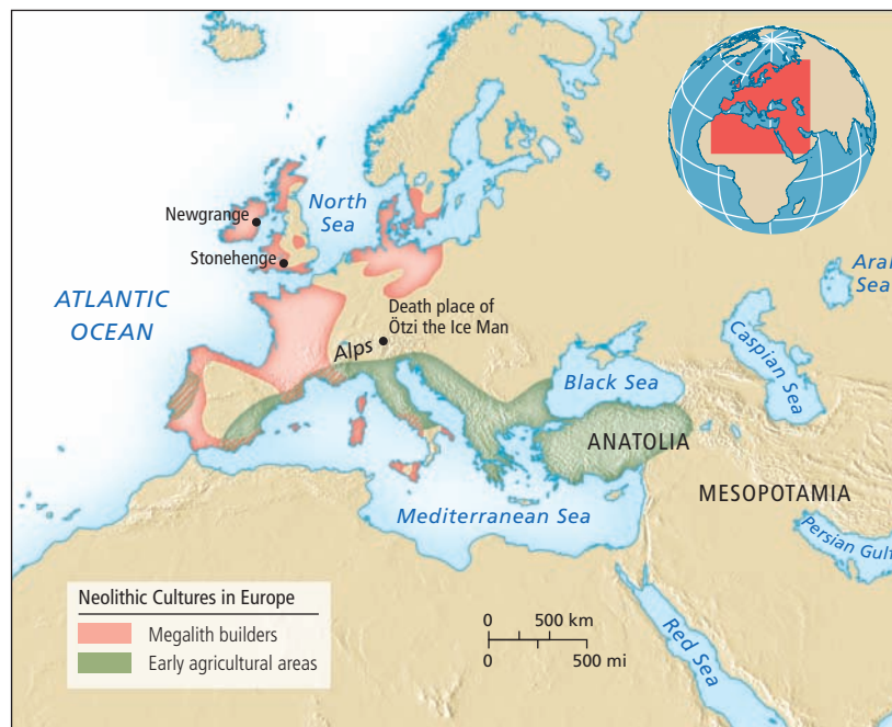
Map 1.3 Neolithic Cultures in Europe

During the Neolithic period, new cultures developed as most of the peoples of Europe changed their way of life from hunting and gathering to food production. What features characterized these early European societies?