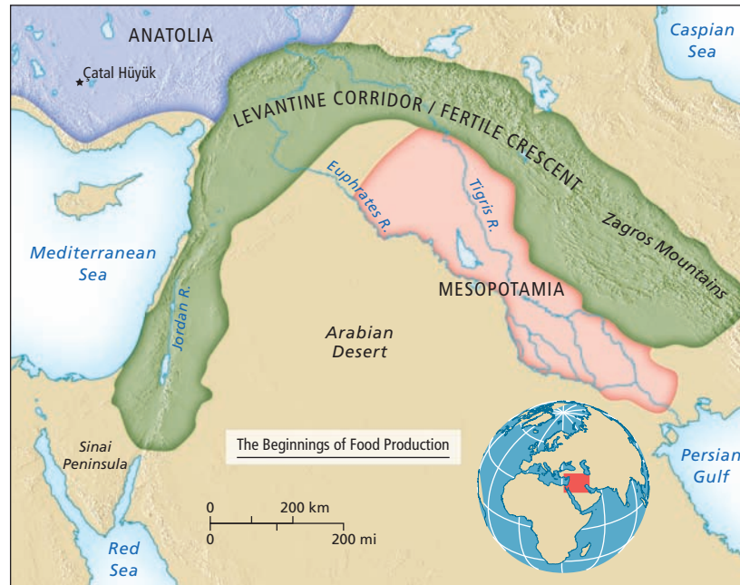
Map 1.2 The Beginnings of Food Production

This map shows early farming sites where the first known production of food occurred in ancient southwest Asia. What were the three areas in which people first began cultivating food?